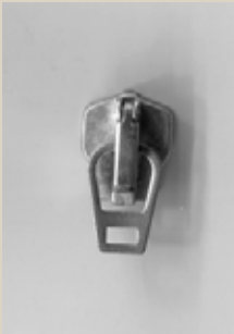
HAA / EOL