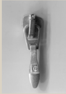
BRA / M7 L